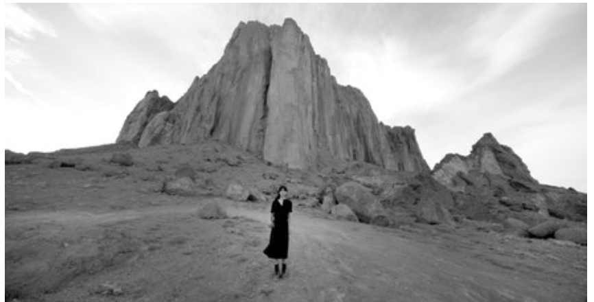
Shirin Neshat, Land of Dreams , 2019. © Shirin Neshat. Courtesy the artist, Gladstone Gallery, New York and Brussels, and Goodman Gallery, Johannesburg, Cape Town, and London.

is when you live in one land and dream in another." Neshat's enduring career represents such a state through cinematic devices and magical realism, offering viewers a visible depiction of exile that only an immigrant could remind us is so deeply connected to the history of the United States.