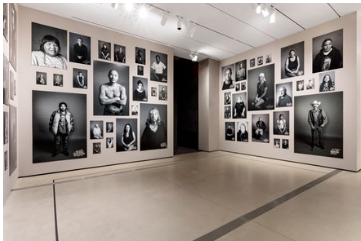
Installation view: Shirin Neshat: I Will Greet the Sun Again, The Broad, Los Angeles, 2019.

The final videos, part of the Dreamers Trilogy, offer the most recent pivot in Neshat's career and in the exhibition's narrative, leading up to her newest work. Both filmed in the US, Illusions and Mirrors (2013) and Roja (2016) are dream-like short videos representing surreal confrontations of young women as they navigate strange landscapes devoid of a specific time or place, the videos are ethereal and work in the space of dream-logic, blurring fact and fiction to exposing truths of human experience. These works mimic dreams, our most vulnerable state, and portray women